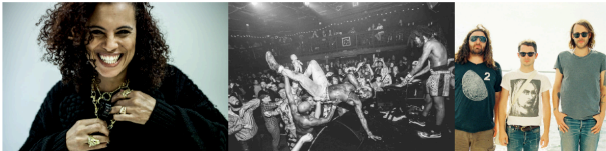
Neneh Cherry with RocketNumberNine

»Pop-Kultur« is much more than a space for concerts and energizing DJ-sets. The festival is a place for knowledge transfer and controversies. Musician Bernard Sumner reads from his new autobiography, while the remaining members of his band New Order – Gillian Gilbert and Stephen Morris – meet Daniel Miller , founder of Mute Records , and composer Owen Pallett for a panel discussion in the impressive Schlackehalle. For the first time in Germany Cocorosie's Bianca Casady will present her solo project " Bianca Casady & The C.i.A. " Swiss high-flyer Sophie Hunger will perform an exclusive show accompanied by a variety of surprise guests.