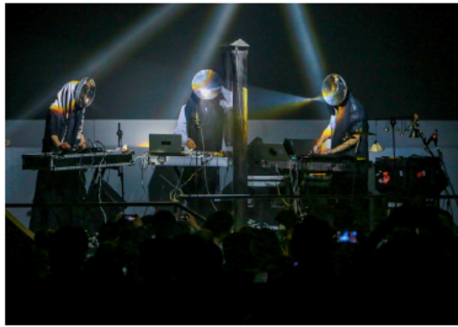
Pantha Du Prince feat. The Triad