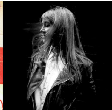
Sophie Hunger